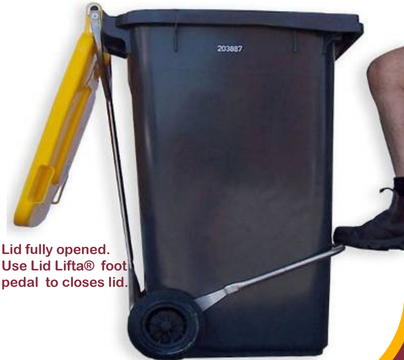
Lid fully opened. Use Lid Lifta® foot pedal to close lid.