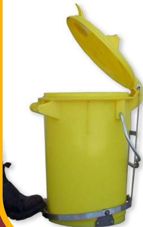
50 litre bin partially open