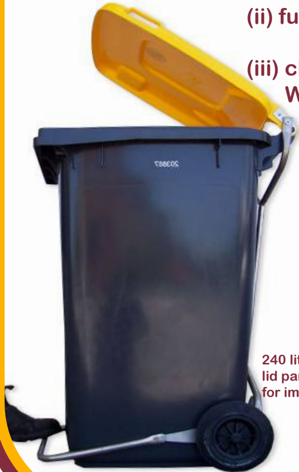
240 litre bin with lid partially open for immediate use.

(iii) close the lid from a fully open position WITHOUT EVER TOUCHING THE LID.